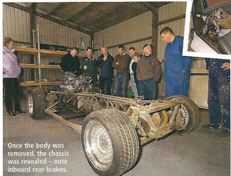
Once the body was removed, the chassis was revealed – note inboard rear brakes.