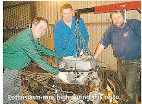
Enthusiasm was high during this resto.

TVR decided to try a prototype 5.0-litre V8 Bathurst race engine, complete with US-spec Borg Warner T5 gearbox, as a possible alternative to the Rover unit. A widening and raising of the chassis rails to accommodate »