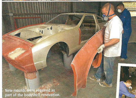
New moulds were required as part of the bodyshell renovation.