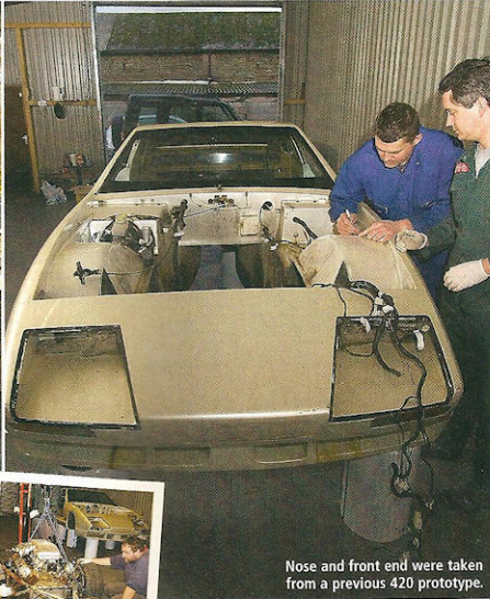
Nose and front end were taken from a previous 420 prototype.