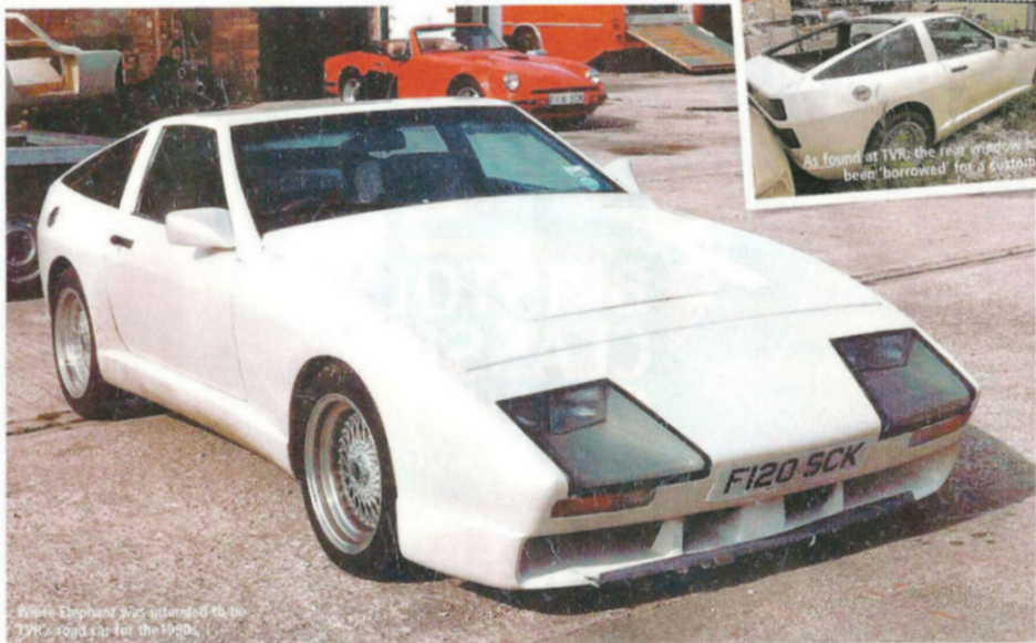
White Elephant was intended to be TVR's road car for the 1980s.

A NEGLECTED TVR PROTOTYPE IS BEING BROUGHT BACK TO LIFE.